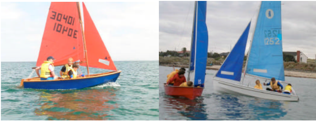
Some photos from recent events.