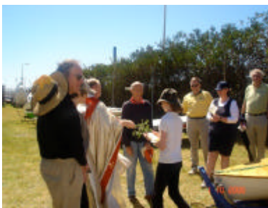
Blessing the fleet.