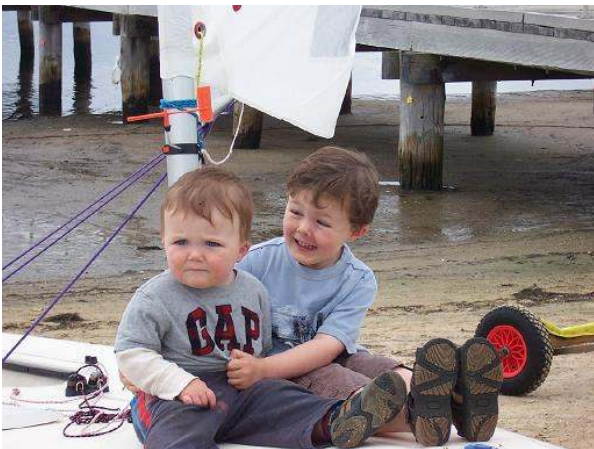
Two aspiring young HSC sailors?

I has been a great start to the 2010/11 racing season. Only two races have been cancelled due to bad weather. Check the race results on the Hampton Sailing Club web site.